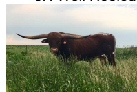
JH Well Heeled